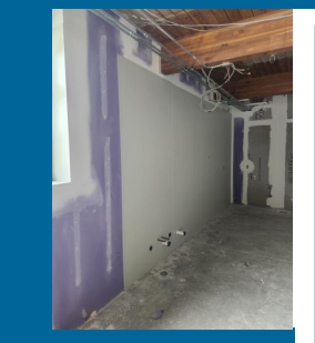
Refrigerator Cooler has been placed. Wall coverings are going up, washable for easy cleaning.