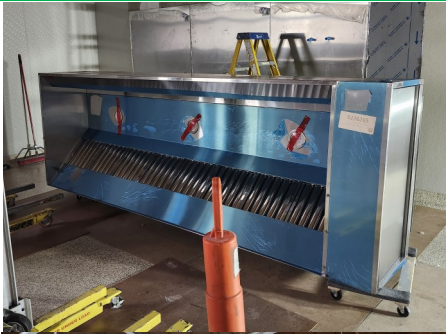
Hood exhaust system laying on its side, ready for installation