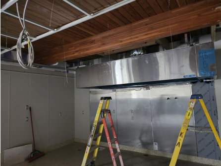
Hood exhaust system in its place and almost ready to be used for cooking.